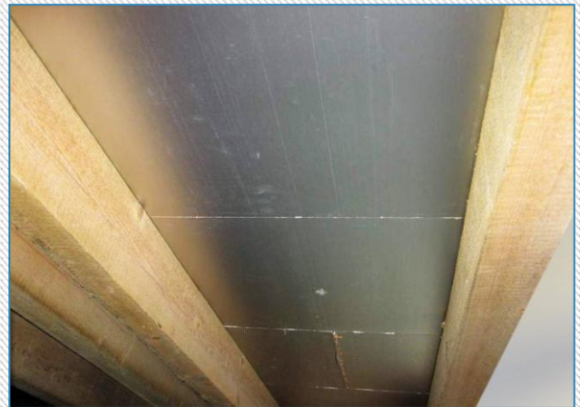
Picture 1: Inside of the pitched roof with the rafters and the insulation layer

The civil engineer noted in his report that the PU insulation boards were found tightly installed against one another with no gaps between them (pictures 1 and 3).